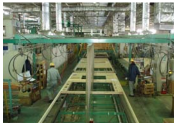
Framing progresses along production line of the Mitsui Saitama Plant Floor in Japan

David outlined how they manufacture to close tolerance the panels which would normally be constructed on site when building a wood frame house.