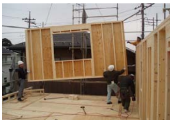
Assembling a House in Tokyo in 24 hours

All panels are double checked for dimension and squared before being shipped. If the panels are large a crane is required to assist in their installation. The base on which the panels rest also has to be square to ensure the panels all fit together correctly. If the concrete sub wall is not square a small pony wall has to be made to provide a level base.